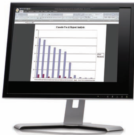
Cassette Use and Repeat Analysis Chart